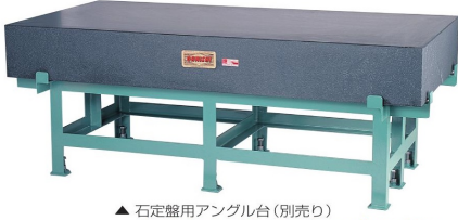
▲石定盤用アングル台 (別売り) Angled stand for granite surface plate (Sold separately)